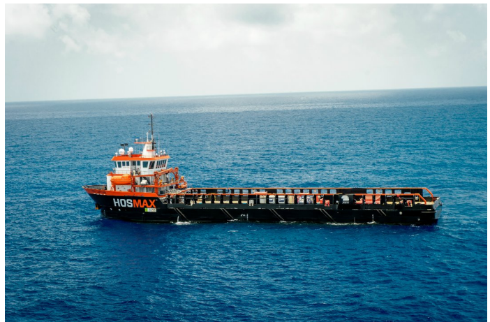
Two ultra high-spec HOSMAX OSVs