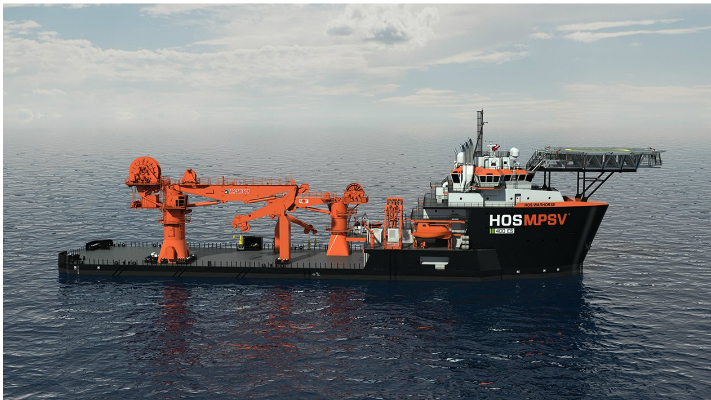
Rendering of Planned HOS 400' Class MPSV

In April 2015, we also outfitted one of our 310 class OSVs that was placed in service under our ongoing newbuild program as a 310 class MPSV in flotel configuration. This U.S.-flagged, Jones Act-qualified MPSV includes a 35-ton knuckle-boom crane, a motion-compensated gangway and accommodations for 194 persons. Being Jones Act-qualified gives it mission flexibility that foreign flag flotels lack in the GoM.