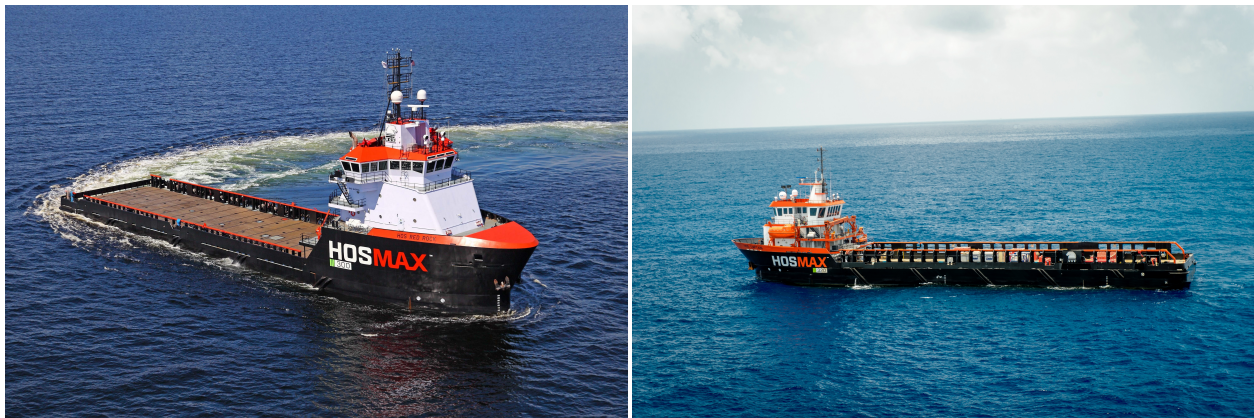
Two ultra high-spec HOSMAX OSVs

Vessels that do not carry a DP-2 notation or have less than 2,500 DWT capacity typically operate in more shallow U.S. waters or in foreign locations in which DP-2 has not yet emerged as the dominant standard. Currently, 18 of our vessels are low-spec, comprising 13% of our fleet by DWT. The remaining 87% of our fleet is considered high-spec, including roughly 60% of our overall fleet that is ultra high-spec.