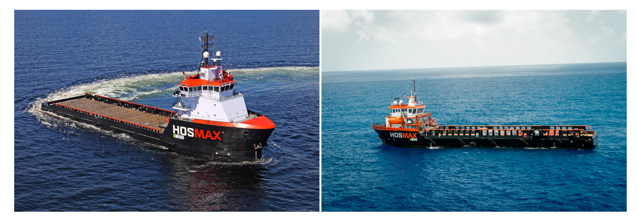
Two ultra high-spec HOSMAX OSVs

Vessels that do not carry a DP-2 notation or have less than 2,500 DWT capacity typically operate in more shallow U.S. waters or in foreign locations in which DP-2 has not yet emerged as the dominant standard. Currently, 18 of our vessels are low-spec, comprising 13% of our fleet by DWT. The remaining 87% of our fleet is considered high-spec, including roughly 60% of our overall fleet that is ultra high-spec.