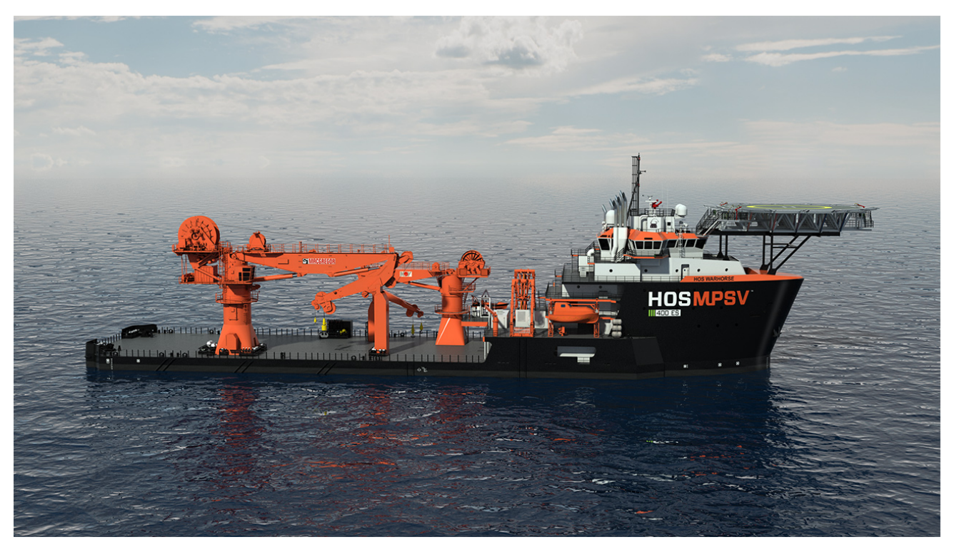
Rendering of Planned HOS 400' Class MPSV

In April 2015, we also outfitted one of our 310 class OSVs that was placed in service under our ongoing newbuild program as a 310 class MPSV in flotel configuration. This U.S.-flagged, Jones Act-qualified MPSV includes a 35-ton knuckle-boom crane, a motion-compensated gangway and accommodations for 194 persons. Being Jones Act-qualified gives it mission flexibility that foreign flag flotels lack in the GoM.