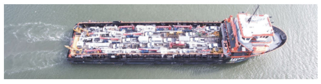
HOS Caledonia responding to Hurricane Maria in Puerto Rico

The versatility of our vessels allows us to support communities in our core geographic areas by providing other non-oilfield services, including humanitarian aid and disaster relief, and service to the aerospace and telecommunications industries. For example, our fleet can support oil spill relief, hurricane recovery, vessel salvage and a broad range of search and rescue operations by deploying vessels to high-need areas in response to natural disasters or crises and providing those affected with lifesaving supplies and equipment. Our humanitarian aid and disaster relief contracts are difficult to predict, given the unexpected and calamitous nature of these projects. Nevertheless, as our reputation, proximity, scale, past experience and fleet relevance for such assistance has grown over the years, we are typically involved in at least one such response annually.