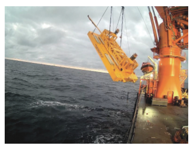
HOS Warland Setting Subsea Equipment

Further, nearly all of our oilfield customers have pledged reductions in their GHG and carbon emissions across their global operations. We believe that these efforts enhance the value of their GoM operations and prospects due to its relatively low carbon intensity. According to a 2022 report published by Wood Mackenzie, the deepwater GoM has one of the lowest carbon footprints in the world. Similarly, as U.S. regulators consider the relative carbon intensity of U.S. oil and gas activities, the deepwater GoM compares favorably with all other domestic and most other global alternatives of oil supply.