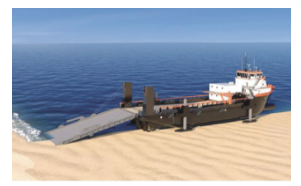
Rendering of the HOS Resolution configured into amphibious landing vessel