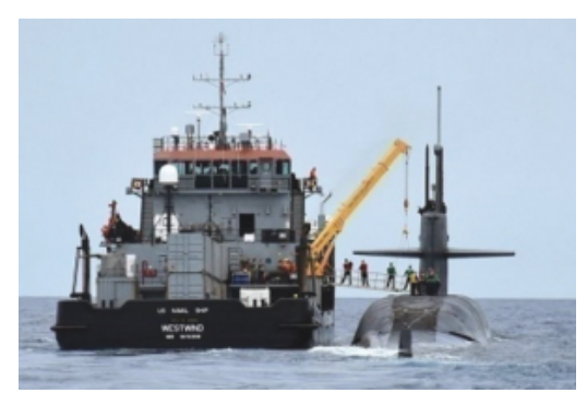
Performing offshore submarine support

Most contracts for work that we perform for the United States Navy are awarded by the MSC, which is an agency within the U.S. Navy that charters vessels for all U.S. armed forces. MSC publicizes its requirements for marine services, and we typically engage in a competitive process in order to be awarded such work. Occasionally, we are awarded charters on the basis of a sole-source award if the project requires unique or specialized services. Our current O&M contract was awarded on a sole-source basis.