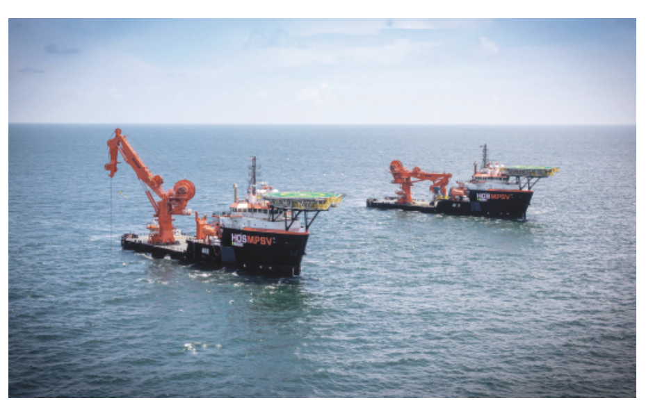
Two HOS MPSVs Deployed in GoM

decommissioning of offshore oilfield facilities and windfarms, humanitarian aid and disaster relief and military missions, by providing accommodations for over one hundred people, in addition to crew and service personnel. MPSVs can also be outfitted as flotels to provide accommodations to large numbers of offshore construction and technical personnel involved in large-scale offshore projects, such as the commissioning of a floating offshore production facility or the construction of offshore wind facilities. When in a flotel mode, the MPSV provides living quarters for third-party personnel, catering, laundry, medical services, recreational facilities and offices and has a helicopter heliport for the embarkation and disembarkation of offshore personnel. In addition, flotels are equipped with articulated gangways between the flotel and other offshore structures that allow personnel to "walk to work." Generally, MPSVs command higher dayrates than OSVs due to their significantly larger relative size and versatility, as well as higher construction and operating costs.