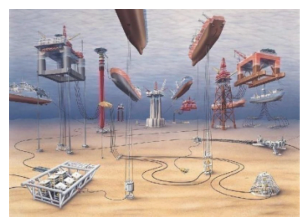
Rendering of Subsea Oil Field

Demand for OSVs, as evidenced by dayrates and utilization rates, is primarily driven by offshore oil and natural gas exploration, development and production activity. Such activity is influenced by a number of factors, including the actual and forecasted price of oil and natural gas, the level of drilling permit activity, capital budgets of offshore exploration and production companies, and the repair and maintenance needs of the floating and subsurface deepwater oilfield infrastructure.