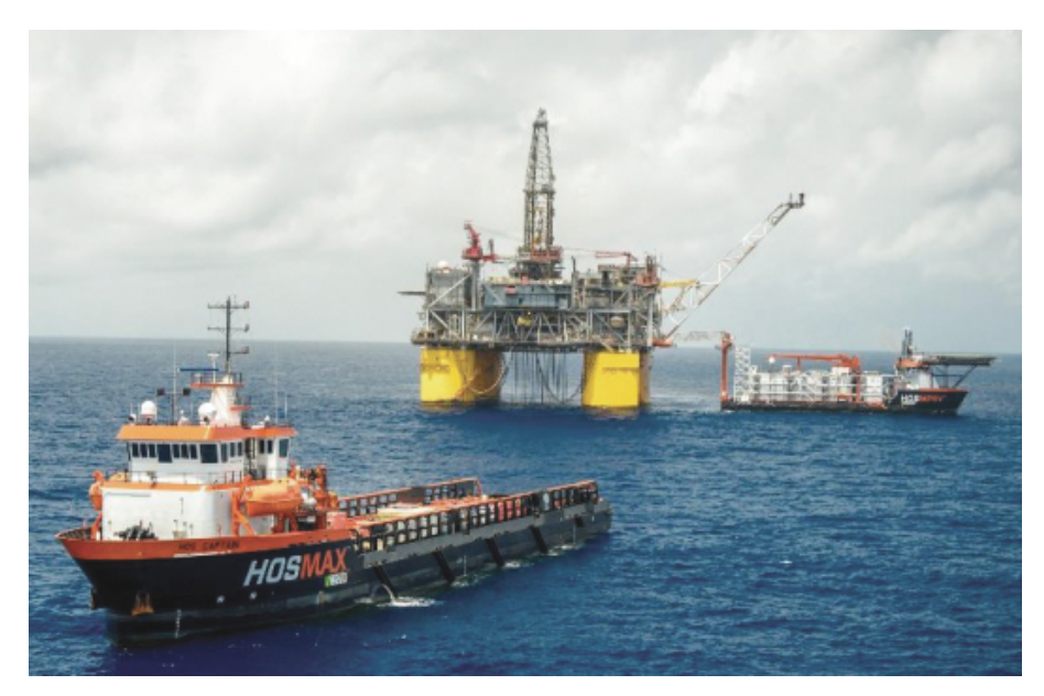
HOSMAX OSV and MPSV flotel servicing an offshore production facility in the U.S. GoM