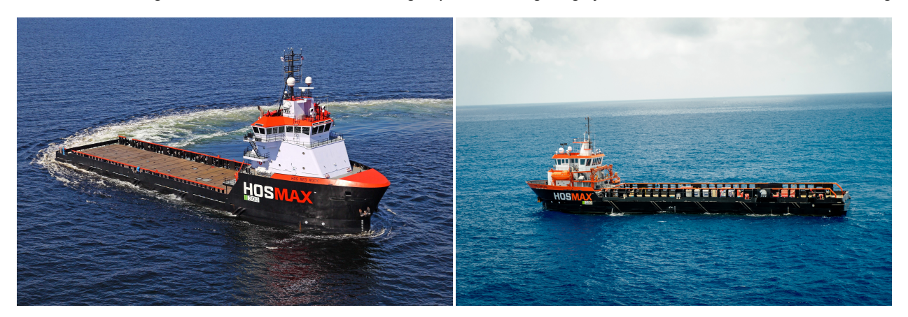
Two ultra high-spec HOSMAX OSVs

Vessels that do not carry a DP-2 notation or have less than 2,500 DWT capacity typically operate in more shallow U.S. waters or in foreign locations in which DP-2 has not yet emerged as the dominant standard. Currently, 18 of our vessels are low-spec, comprising 13% of our fleet by DWT. The remaining 87% of our fleet is considered high-spec, including roughly 60% of our overall fleet that is ultra high-spec.