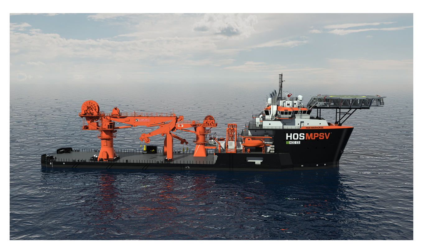
Rendering of Planned HOS 400' Class MPSV

In April 2015, we also outfitted one of our 310 class OSVs that was placed in service under our ongoing newbuild program as a 310 class MPSV in flotel configuration. This U.S.-flagged, Jones Act-qualified MPSV includes a 35-ton knuckle-boom crane, a motion-compensated gangway and accommodations for 194 persons. Being Jones Act-qualified gives it mission flexibility that foreign flag flotels lack in the GoM.