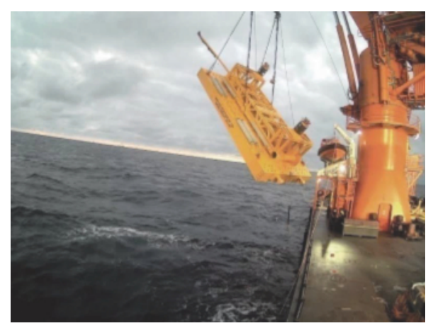
HOS Warland Setting Subsea Equipment

Further, nearly all of our oilfield customers have pledged reductions in their GHG and carbon emissions across their global operations. We believe that these efforts enhance the value of their GoM operations and prospects due to its relatively low carbon intensity. According to the 2021 Wood Mackenzie Article, the deepwater GoM has one of the lowest carbon footprints in the world. Similarly, as U.S. regulators consider the relative carbon intensity of U.S. oil and gas activities, the deepwater GoM compares favorably with all other domestic and most other global alternatives of oil supply.