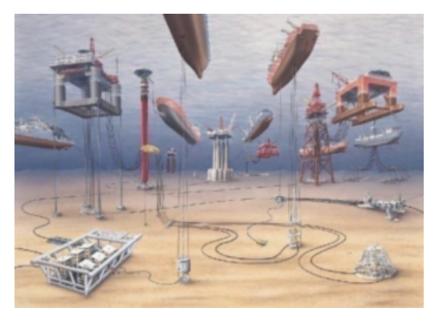
Rendering of Subsea Oil Field

Demand for OSVs, as evidenced by dayrates and utilization rates, is primarily driven by offshore oil and natural gas exploration, development and production activity. Such activity is influenced by a number of factors, including the actual and forecasted price of oil and natural gas, the level of drilling permit activity, capital budgets of offshore exploration and production companies, and the repair and maintenance needs of the floating and subsurface deepwater oilfield infrastructure.